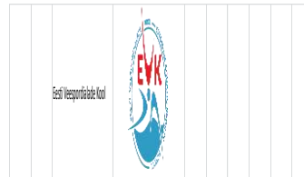
FIGURE DETAILED RESULTS - AGE GROUP 8 AND UNDER